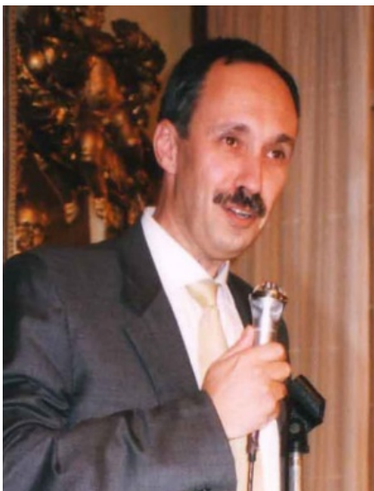
1997 EACWE2 in Genova

He seemed to have hastened to his death, leaving this great classic for us.