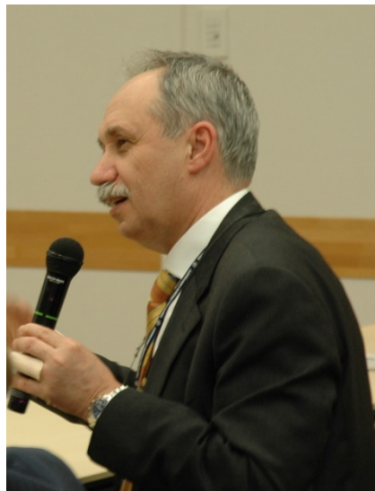
2008 ISWE3 in Tokyo